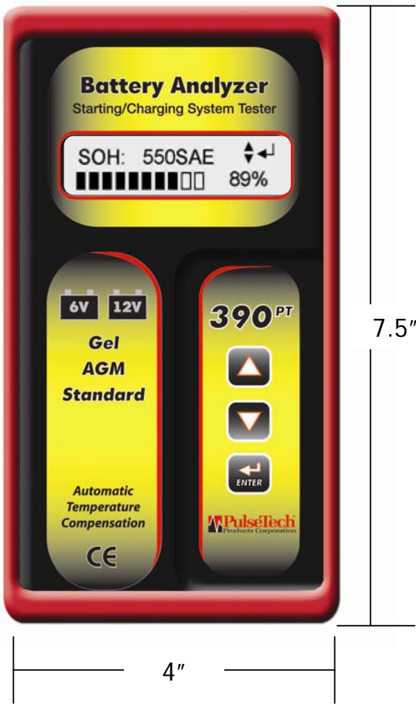
Sample Screen Shots